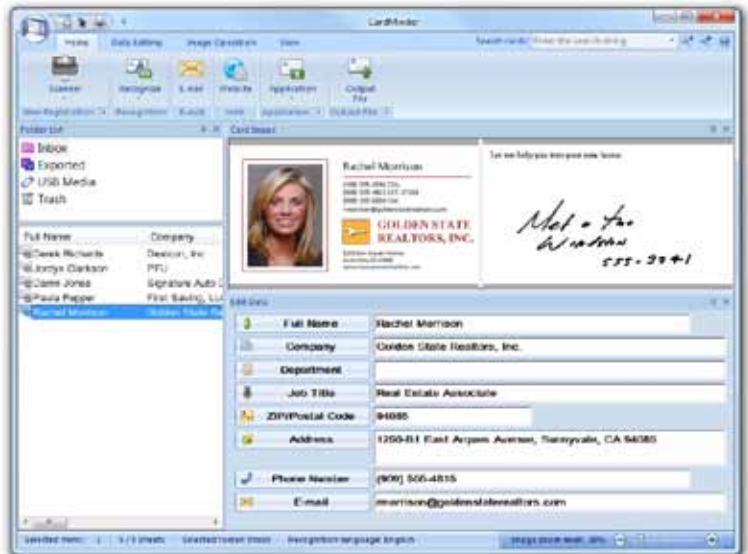
CardMinder for Windows® shown

Scan, store, and edit business card information with the bundled CardMinder software for Mac and PC and even export data into other applications like Address Book, Excel, and Salesforce.