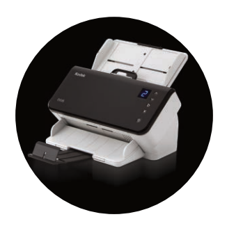
Kodak E1025 and E1035 Scanners

^{\star} Throughput speed may vary depending on your choice of application software, operating system, PC and selected image processing features.