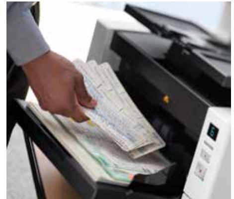
SurePath Paper Handling automatically adjusts for a variety of document sizes and thicknesses.

Optional Kodak Legal Size and A3 Size Flatbed Accessories for added capability to scan bound, oversized and fragile documents.